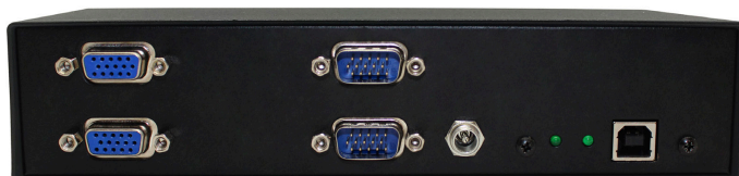
SM-VDX-500-DH-TX Back panel