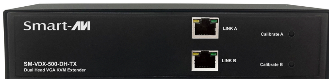
SM-VDX-500-DH-TX Front panel