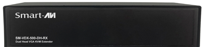
SM-VDX-500-DH-RX Front panel