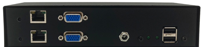
SM-VDX-500-DH-RX Back panel