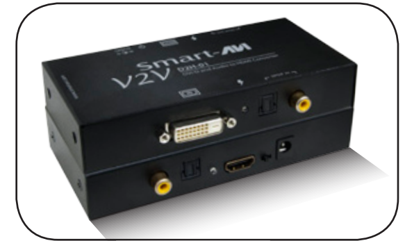
DVI-D and Digital Audio to HDMI Converter