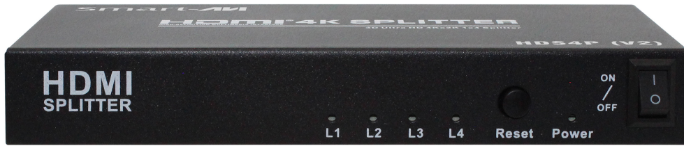
HDS4P (V2) Front