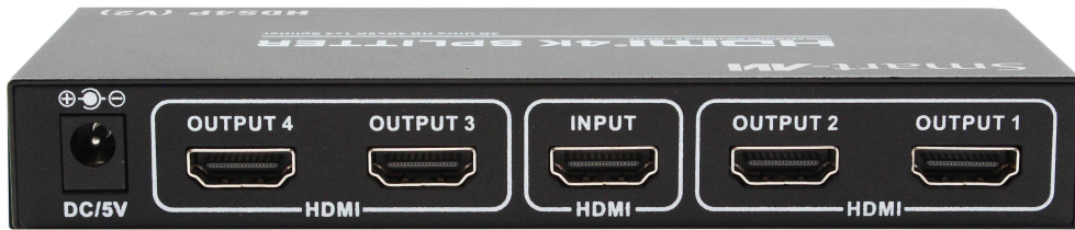
HDS4P (V2) Back