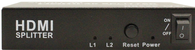
HDS2P (V2) Front