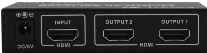
HDS2P (V2) Back