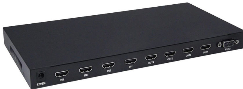
HDR-4x4 Plus V2 Back