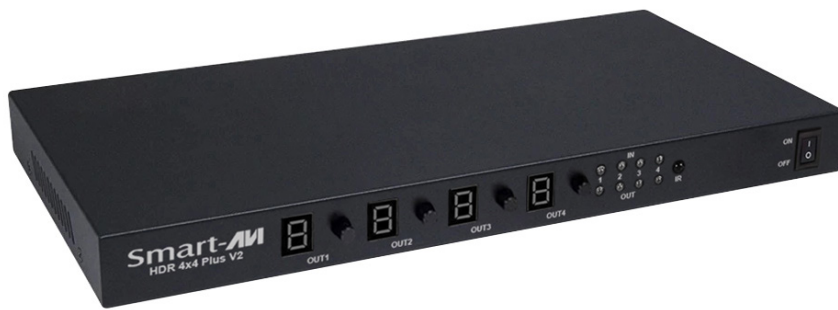
HDR-4x4 Plus V2 Front