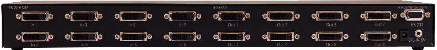
DVR 8x8 Back