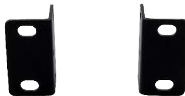
DVR 8x8 Rack Ears