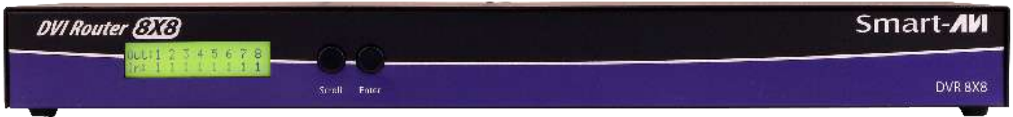
DVR 8x8 Front