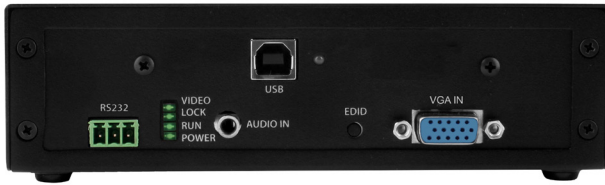
FVX-3000-PRO Transmitter Front Panel