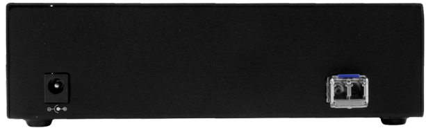
FVX-3000-PRO Receiver Back Panel