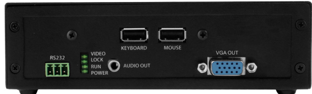
FVX-3000-PRO Receiver Front Panel